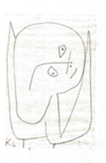
Angel full of hope (Klee)

(walking distance) ✉ Bismarckallee 23 14193 Berlin Germany ☎ +49-30-896 88-160 💻 info@st-michaels-heim.de 🌐 www.johannisches-sozialwerk.de